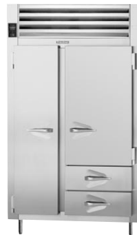
Dual-Temp Model UR48DT (shown as supplied standard)